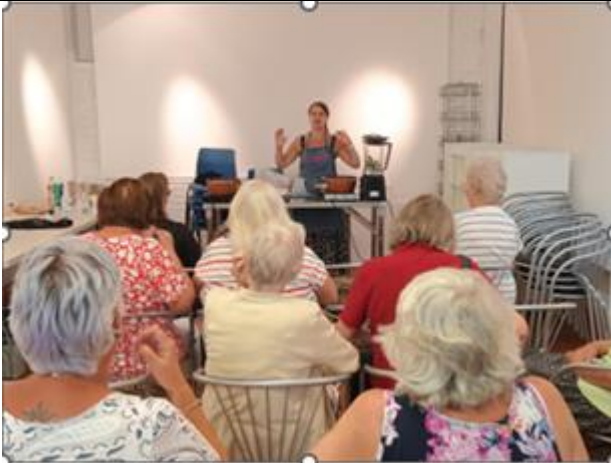
Cooking demonstration arranged in collaboration with PLANED

st clears town council cyngor tref sanclêr