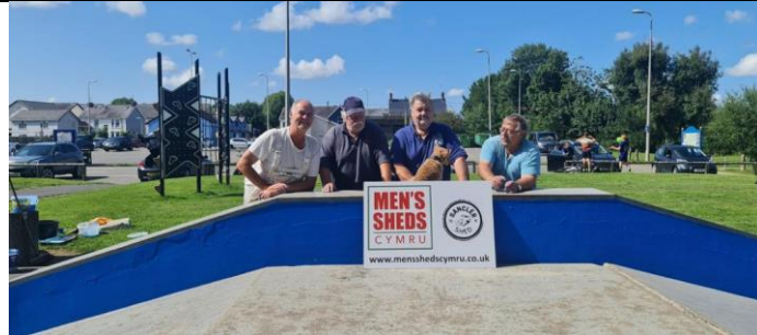
St Clears Men's Shed carrying out voluntary work in the community in line with the Town Council's volunteering policy. Lovely paint job!