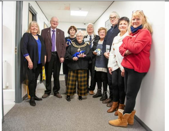
Bandi Appeal Annual Meeting. Town Mayor attends the meeting and hears an update on the charity's work. Good wishes to them for the future.